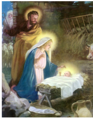
Birth of Christ in the manger

In the book of Luke, Archangel Gabriel comes to Mother Mary to tell her that she will be the mother of the Christ.