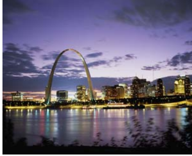
St. Louis Arch, Missouri, USA