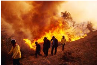
Firemen at work

If you see a fire, you call the firemen. If you have a broken pipe in your house, you parents call the plumber. You have to ask the right person to get the help you want.