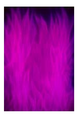
Violet transmuting flame

You can imagine the violet flame like a great cosmic eraser. It erases, or transmutes, all that is not joy and light and love.