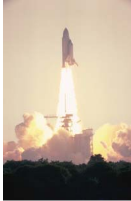
Space shuttle launch

They saw seven large angels, with wings as large as jumbo jets! The angels were smiling, as though they shared in a wonderful secret. What is their secret? They are so large and powerful, they can dissolve the biggest problems we have on earth!