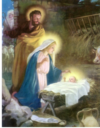
Birth of Jesus in the manger